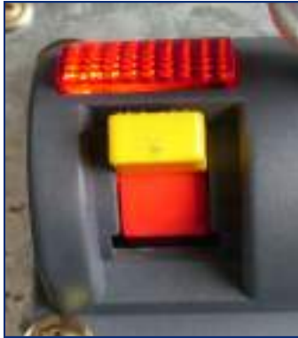
REAR DOOR SWITCH

This opens the lock in tabs at tray rear. The rear door will then automatically open as tub is lifted. Once load has been cleared and tub lowered switch rocker to "Off" position to lock door back closed ready for new load.