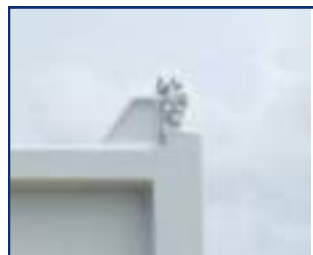
REAR DOOR LATCH

The module has several different options for tipping off the load. in regards to the rear door. The door can be manually opened and locked back in place or the automatic option can be utilized. To open manually and lock open, unlock latch at tipper door top right corner (pictured left, swing door open manually and lock in place using pin.