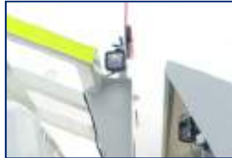
Work Lights Mounted to ROPS

Adjust the work lights to ensure your workspace is well lit whilst the vehicle is stationary.