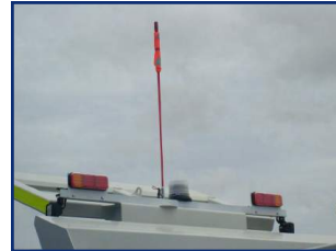
Work Lights Mounted to ROPS